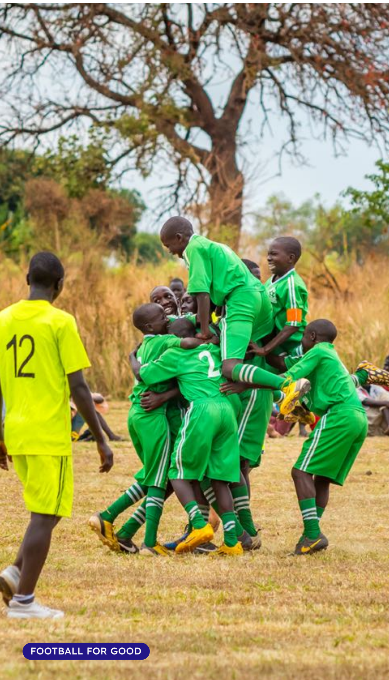
FOOTBALL FOR GOOD